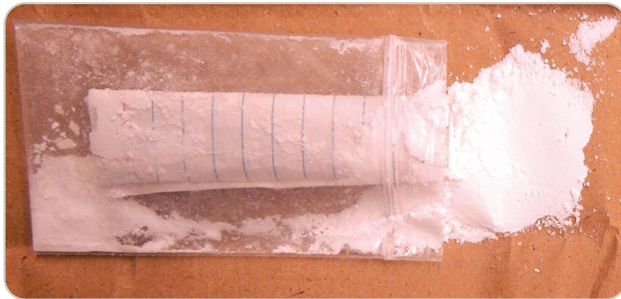
Synthetic Opioid powder U-47700.