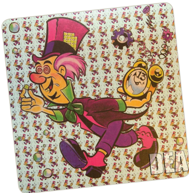
LSD Blotter Sheet