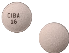
Ritalin SR 20mg tablet

Stimulants are diverted from legitimate channels and clandestinely manufactured exclusively for the illicit market.