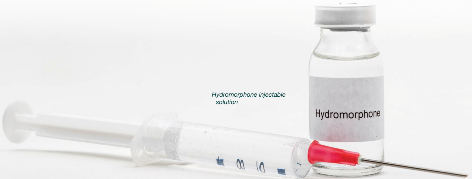
Hydromorphone injectable solution