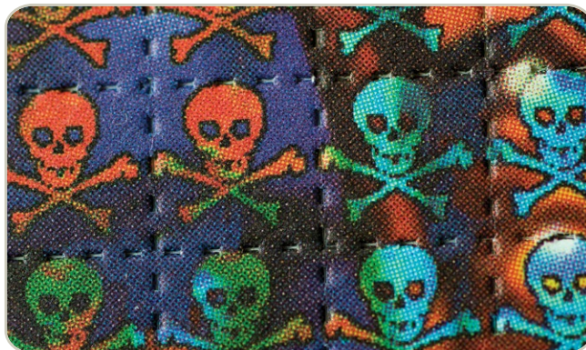
LSD blotter paper

During the first hour after ingestion, users may experience visual changes with extreme changes in mood. While under the influence, the user may suffer impaired depth and time perception accompanied by distorted perception of the shape