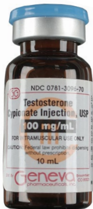
Testosterone Cypionate Injection, USP