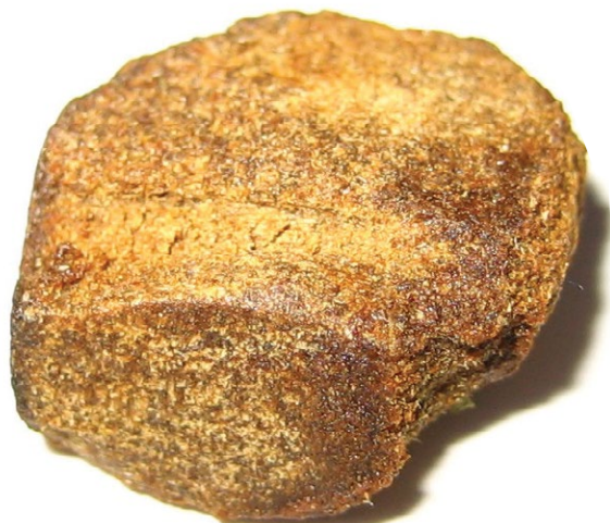
Marijuana concentrate

Marijuana concentrates can be mixed with various food or drink products to be consumed orally; however, smoking remains the most popular route of administration by use of water or oil pipes. A disturbing aspect of this emerging threat is the inhalation of concentrates via electronic cigarettes (also known as e-cigarettes) or vaporizers. Many marijuana concentrate users prefer the e-cigarette/vaporizer because it is smokeless, sometimes odorless, and easy to hide or conceal. The user takes a small amount of marijuana concentrate, referred to as a “dab,” then heats the substance using the e-cigarette/vaporizer producing vapors that ensures an instant “high” effect upon the user. Using an e-cigarette/vaporizer to inhale marijuana concentrates is commonly referred to as “dabbing” or “vaping.”