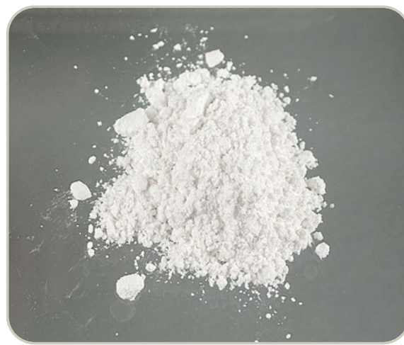
White powder heroin