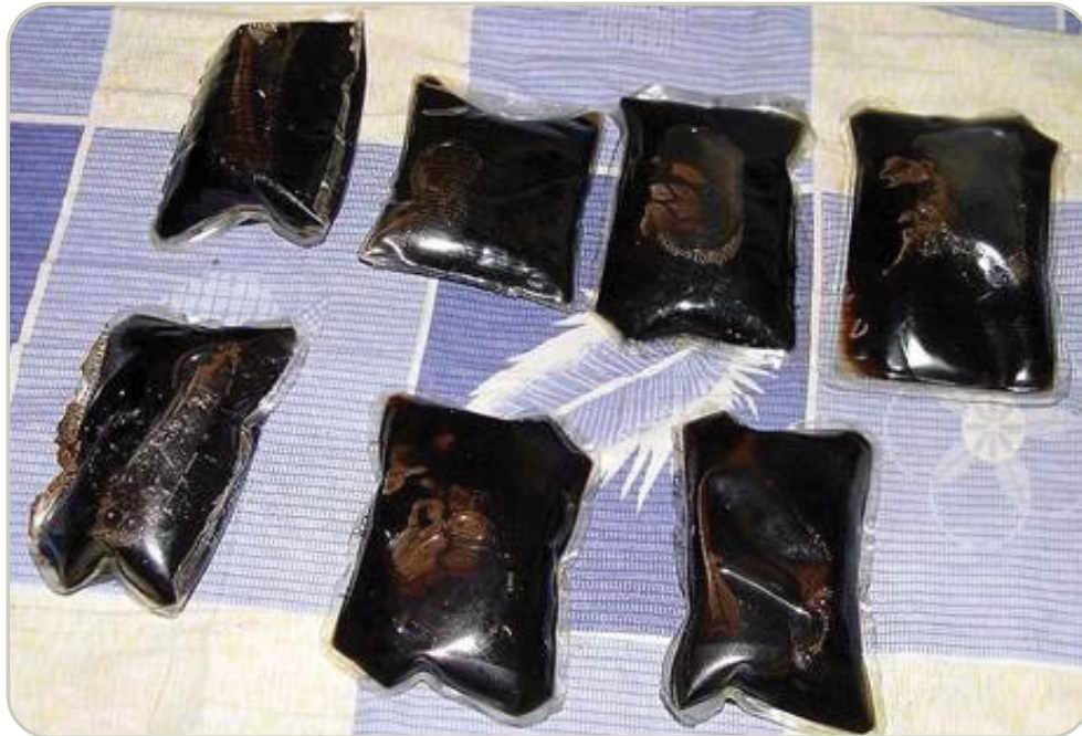
Heroin liquid packets