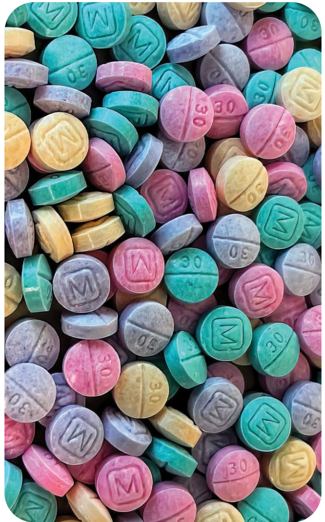
Fake rainbow oxycodone M30 tablets containing fentanyl

Fentanyl is a Schedule II narcotic under the United States Controlled Substances Act of 1970.