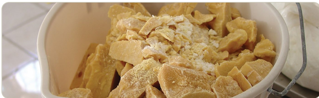
Methamphetamine in finished form

Methamphetamine is a Schedule II stimulant under the Controlled Substances Act, which means that it has a high potential for abuse and a currently acceptable medical use (in FDA-approved products). It is available only through a prescription that cannot be refilled. Today there is only one legal meth product, Desoxyn®. It is currently marketed in 5, 10, and 15-milligram tablets (immediate release and extended release formulations) and has very limited use in the treatment of obesity and ADHD.