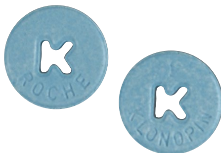
Klonopin 5mg tablet

Most depressants are controlled substances that range from Schedule I to Schedule IV under the Controlled Substances Act, depending on their risk for abuse and whether they currently have an accepted medical use. Many of the depressants have FDA-approved medical uses. In the United States, Rohypnol® and Quaaludes® are not manufactured or legally marketed, and have no accepted medical use.