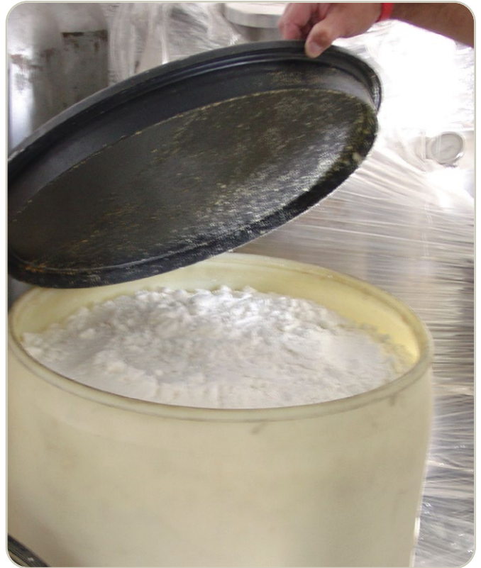
Methamphetamine in finished form

Regular meth is a pill or powder. Crystal meth resembles glass fragments or shiny blue-white “rocks” of various sizes.