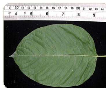
Leaf of kratom tree