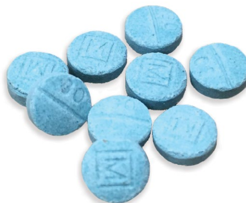
Clandestinely produced fake oxycodone tablets that contain fentanyl.

Abuse of clandestinely produced synthetic opioids parallels that of heroin and prescription opioid analgesics. Many of these illicitly produced synthetic opioids are more potent than morphine and heroin and thus have the potential to result in a fatal overdose.