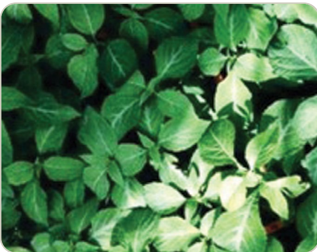
Leaves of the Salvia divinorum plant

The plant has spade-shaped variegated green leaves that look similar to mint. The plants themselves grow to more than three feet high, have large green leaves, hollow square stems, and white flowers with purple calyces.