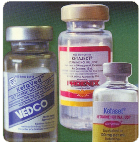
Vials containing liquid ketamine

Ketamine, along with the other “club drugs,” has become popular among teens and young adults at dance clubs, musical festivals, and concerts. Ketamine is manufactured commercially as a powder