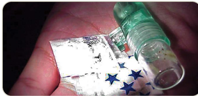
Ketamine in various forms