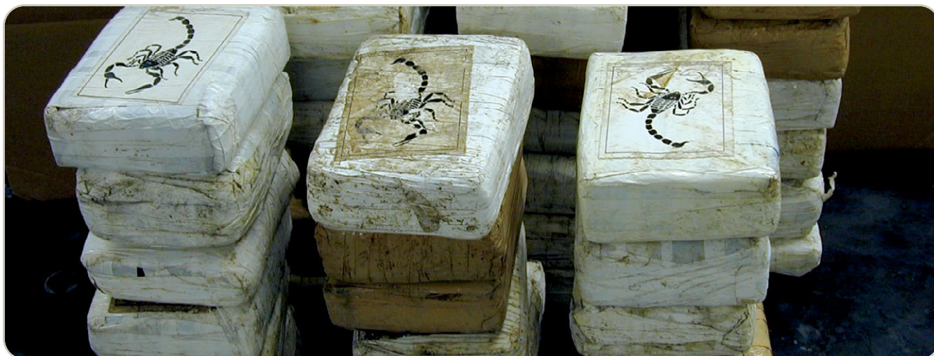
Cocaine bricks, seized by DEA

Cocaine is a Schedule II drug under the Controlled Substances Act, meaning it has a high potential for abuse and has an accepted medical use for treatment in the United States. Cocaine hydrochloride solution (4 percent and 10 percent) is used primarily as a topical local anesthetic for the upper respiratory tract. It also is used to reduce bleeding of the mucous membranes in the mouth, throat, and nasal cavities. However, more effective products have been developed for these purposes, and cocaine is now rarely used medically in the United States.