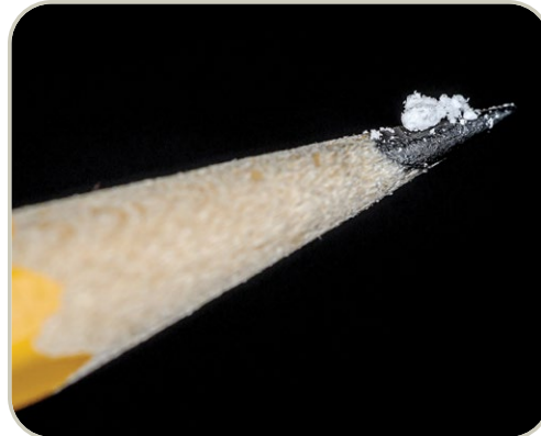
A lethal dose of fentanyl

According to the Centers for Disease Control and Prevention (CDC), overdose deaths involving synthetic opioids, excluding methadone were involved in roughly 2,600 drug overdose deaths each year in 2011 and 2012, but from 2013 through 2021, the number of drug overdose deaths involving synthetic opioids, excluding methadone increased dramatically each year, to more than 68,000 in 2021. The total number of overdose deaths for this category was greater than 258,000 for 2013 through 2021. These overdose deaths involving synthetic opioids is primarily driven by illicitly manufactured fentanyl, including fentanyl analogs. Consistent with overdose death data, the trafficking, distribution, and abuse of illicitly produced fentanyl and fentanyl analogs positively correlates with the associated dramatic increase in overdose fatalities.