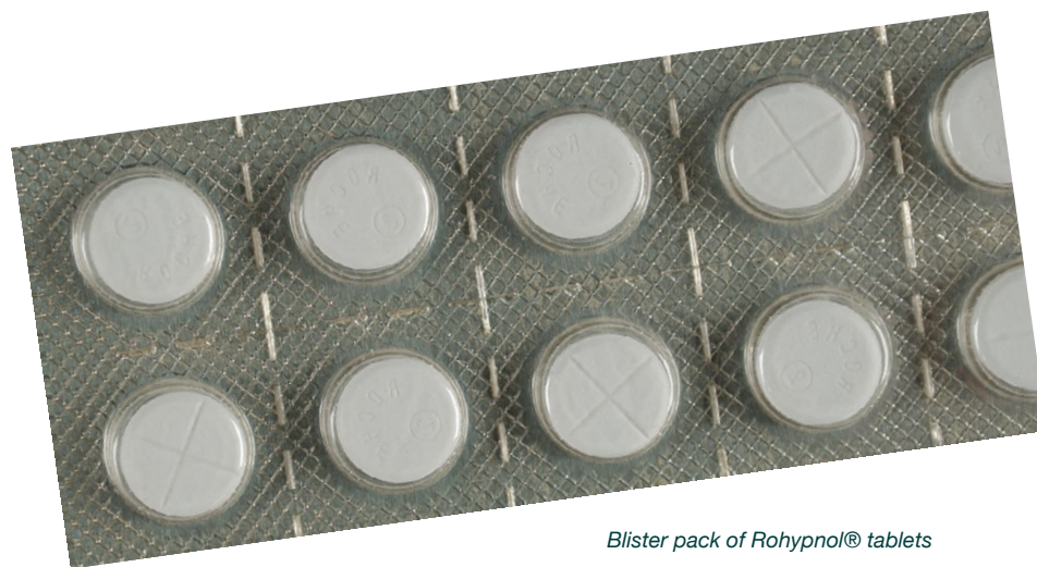
Blister pack of Rohypnol® tablets

Rohypnol® is a Schedule IV substance under the Controlled Substances Act. Rohypnol® is not approved for manufacture, sale, use, or importation to the United States. However, it is legally manufactured and marketed in other countries. Penalties for possession, trafficking, and distribution involving one gram or more are the same as those of a Schedule I drug.