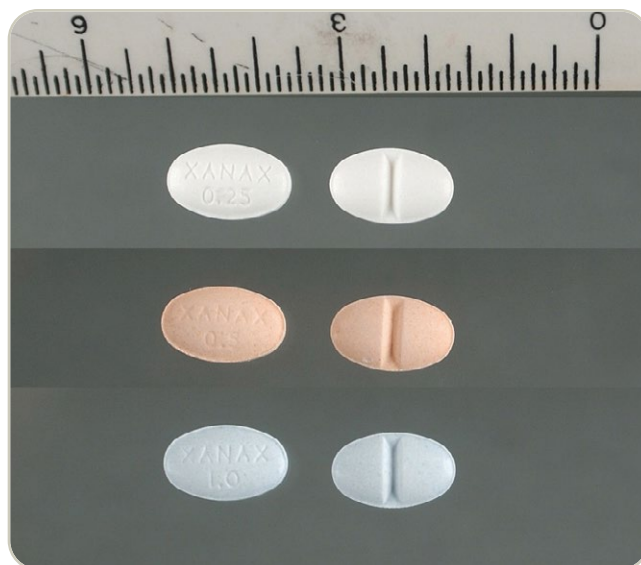
Xanax 0.25, 0.5 and 1mg scored tablets

Generally, legitimate pharmaceutical products are diverted to the illicit market. Teens and others can obtain depressants from the family medicine cabinet, friends, family members, the Internet, doctors, and hospitals.